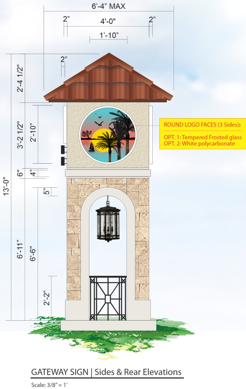
GATEWAY SIGN | Sides & Rear Elevations