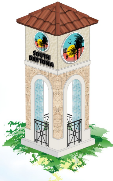
GATEWAY SIGN | Isometric view