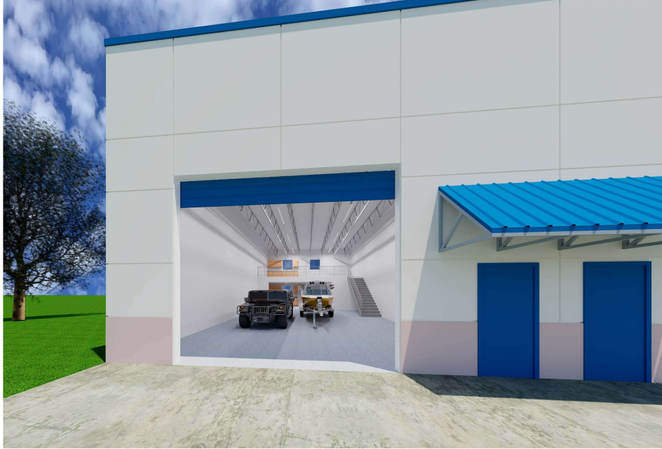
EXTERIOR RENDER 1