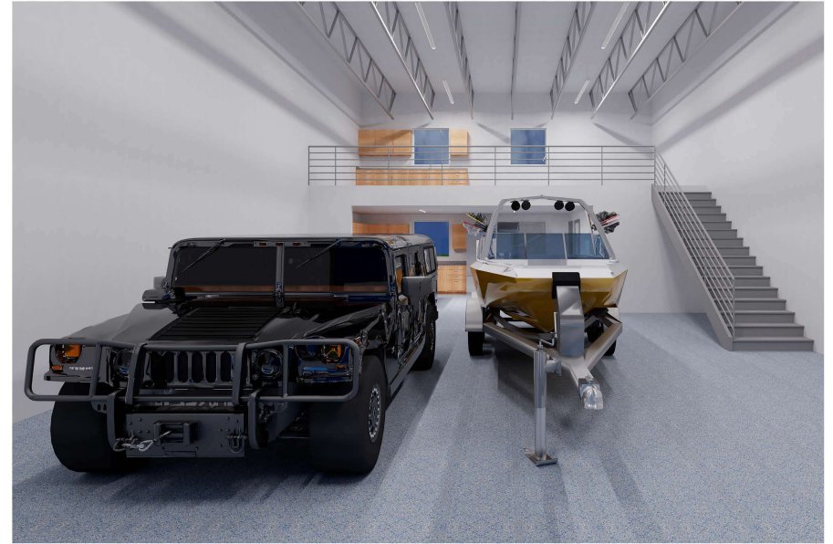
INTERIOR RENDER 2