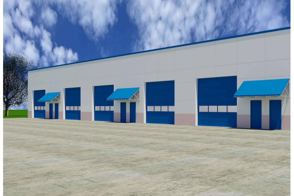
EXTERIOR RENDER 2