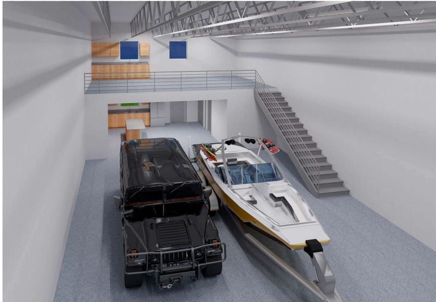
INTERIOR RENDER 3