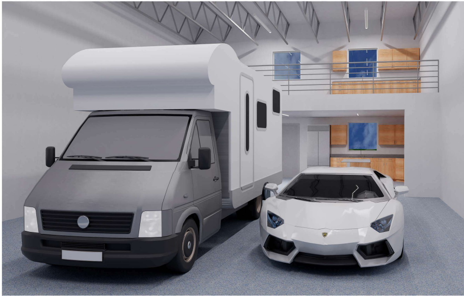
INTERIOR RENDER 1