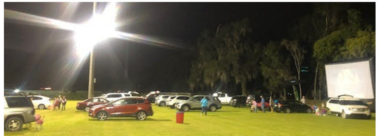
Curbside Cinema Movie Night in November

Parks and Recreation has had an awesome end of the year with a Drive Thru Halloween event, movie night, and Drive Thru Christmas. We are so happy to have had so many residents attend our events and we are looking forward to doing more throughout 2021.