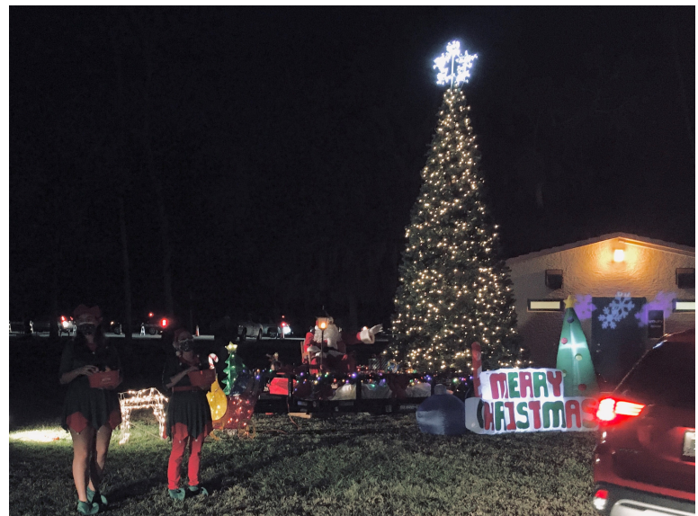
Santa and his Elves at the North Pole Drive Thru

Follow us on Facebook @City Of South Daytona Parks and Recreation for more information on upcoming events and the start of Spring Baseball!