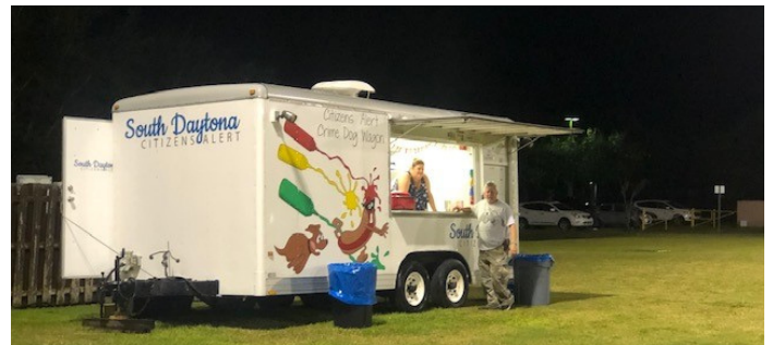
Citizens Alert's Hot Dog Wagon at the Movie Night event