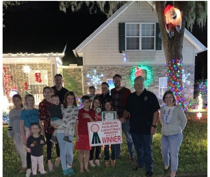
2019 Holiday Lighting Award Winner

Holiday Lighting Awards 2020! Each year, the City of South Daytona recognizes and awards the best holiday decorated homes and businesses in South Daytona. Homes and businesses are nominated by calling the Parks and Recreation office at (386) 322-3070. Please make sure to complete your decorating by Friday, December 5th. Awards and presentations will take place on the evening of Thursday, December 10th.