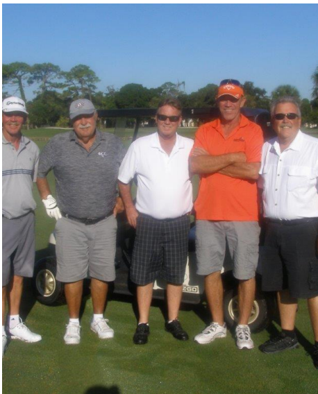
2018 Golf Tournament

One of the programs that is supported by the Trust is the Community Outreach Assistance Program that aids qualified homeowners in need of residential home repairs. Examples include, a new roof, or air/heat replacement, as well as installation of handicap access. Each year, the Community Trust Scholarship awards $1,500 to a South Daytona high school student who has worked to better our community through volunteerism.